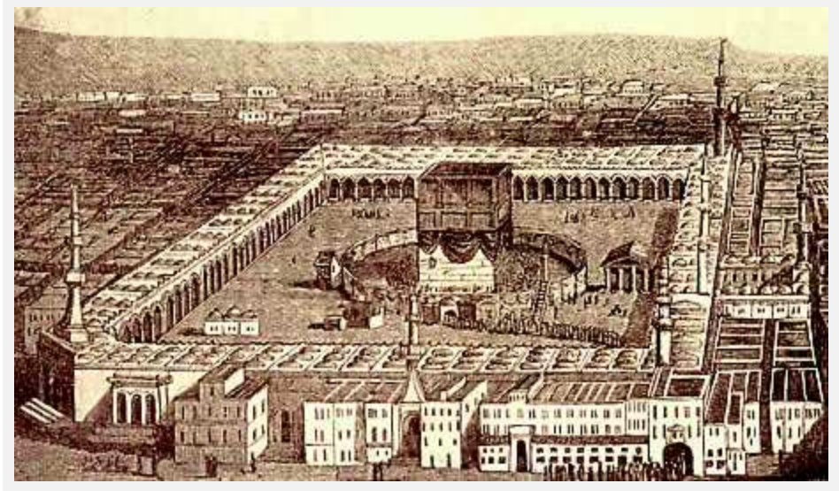
THE MOSQUE AT MECCA